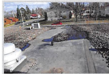
Left: Leaky roof Bottom left: No safe access to athletic fields Bottom right: Outdated classrooms with air quality problems