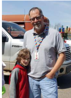
Beautiful Day for FFA!