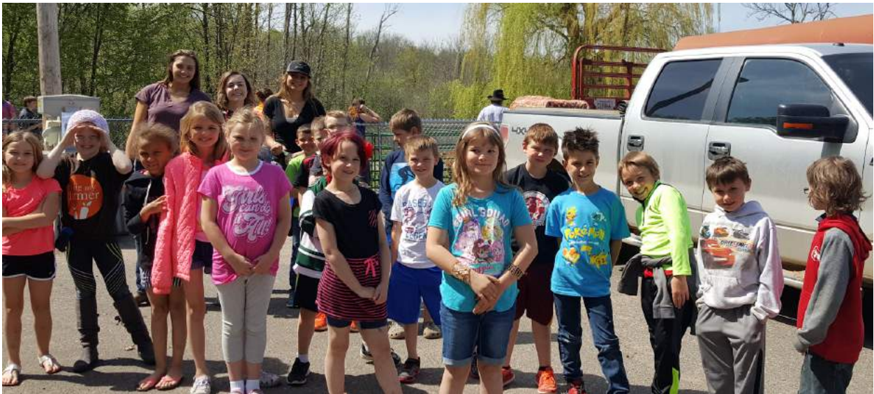
FFA Farming to Rippleside! Students were able to see the farm animals up close and personal.